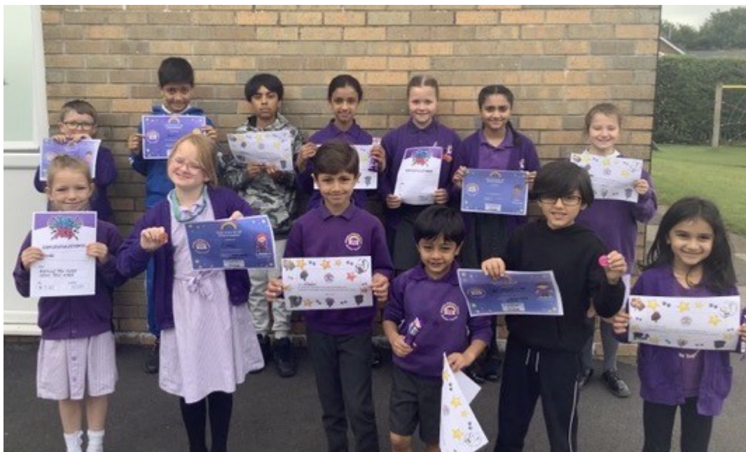
Our Sharples' Values, Reading Award and TTRockstars winners this week. Congratulations everyone!