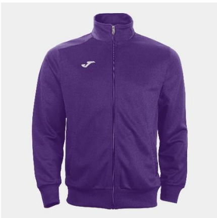
Full Purple Zip through £16

As you are aware, we are introducing our compulsory PE jumpers from next September. We have narrowed it down to a choice of two – both will have the school badge on. All stakeholders will vote on their preferred top. School will be contributing to every child's first top. Children will wear them twice a week. Please complete the google form with your preference: https://forms.gle/4EFsYoXXwP1ttRcTA