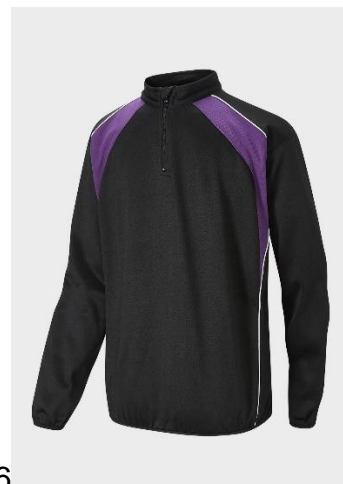
Quarter zip option £22