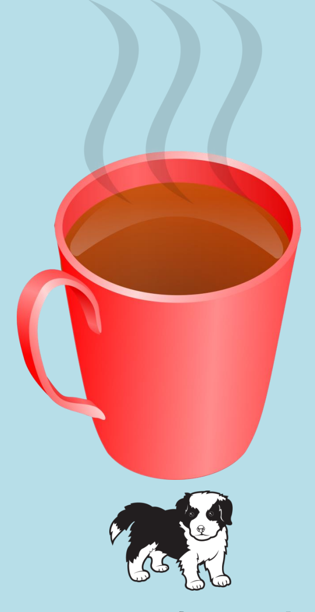
Dog is under the cup.