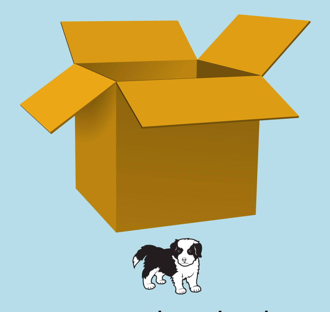
Dog is under the box.